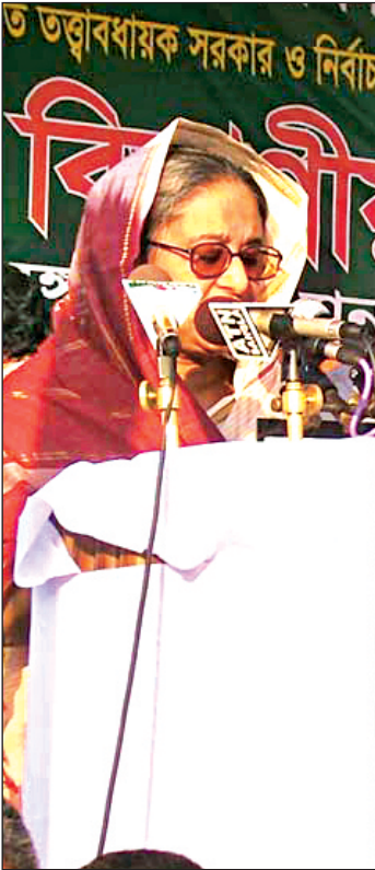
Awami League President Sheikh Hasina speaks at the 14-party divisional grand rally in Barisal yesterday.