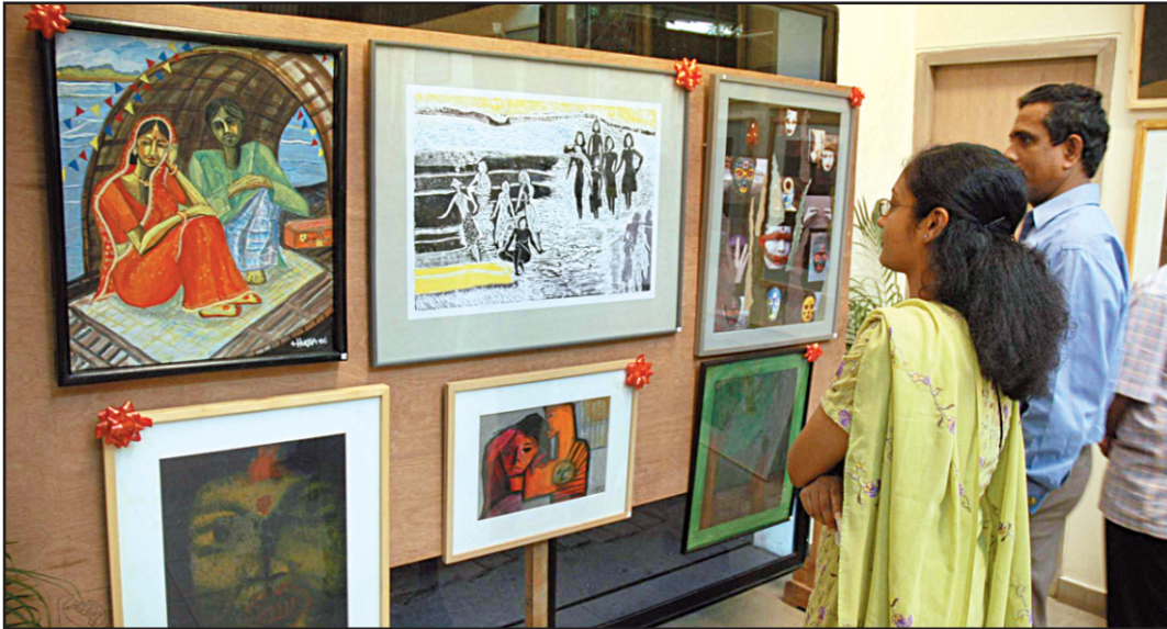
Viewers looking at the prize winning paintings

One of the winning paintings had the picture of a new bride in red, being taken home in a boat to her in-laws. The bridegroom too