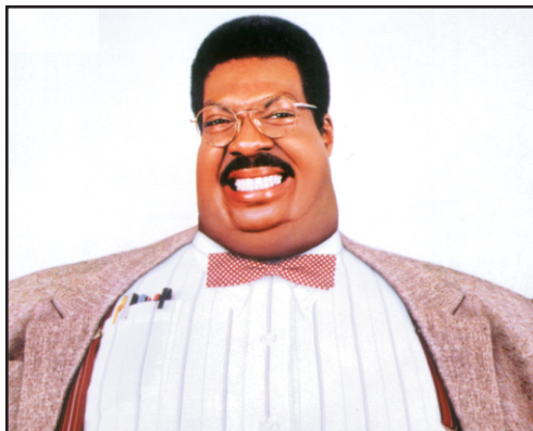
The Nutty Professor