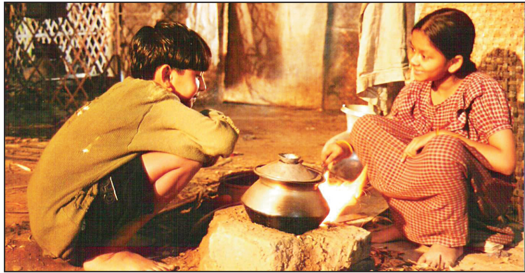
Child actors in a scene from Morshedul Islam's Duratta

The discussants focused on the importance of making quality films for children for their intellec-