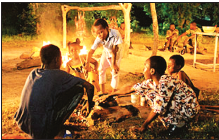
Scenes from Days of Santiago (Top) and The Night of Truth