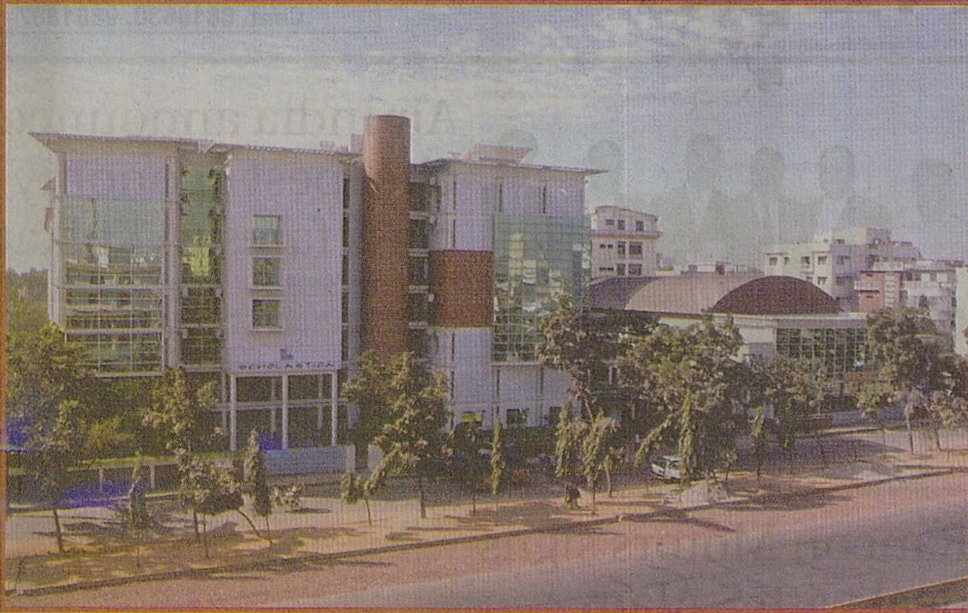
Senior School Campus, Uttara