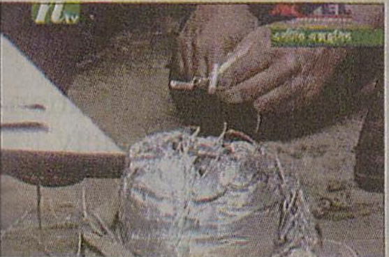
and the drilled hole on the roof to peep inside.