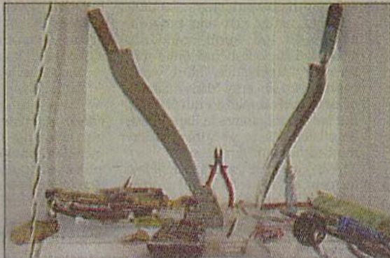
sharp weapons, bomb-making tools, bomb and books including some written by Golam Azam found at the house;