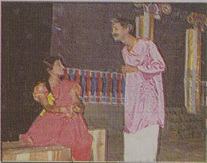
One of the plays to be staged at the festival