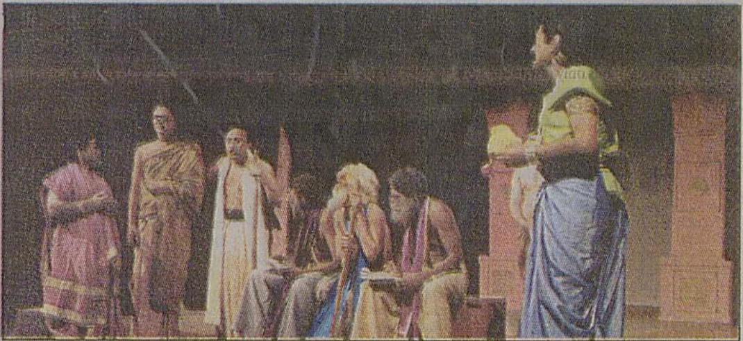
A scene from Mrichchhakatik