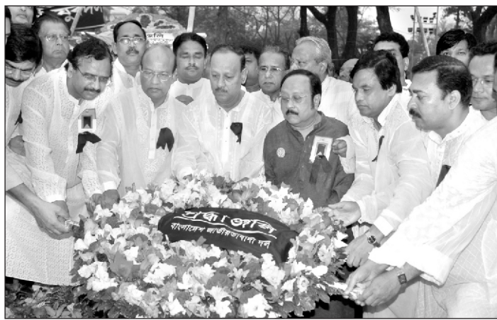
Bangladesh Nationalist Party