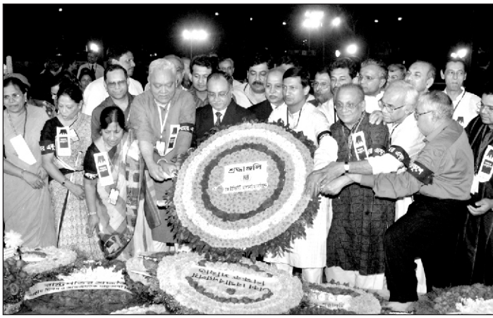
Dhaka University Alumni Association