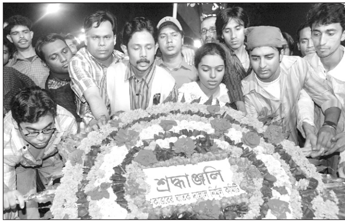
Committee to Resist Wartime Criminals and Collaborators