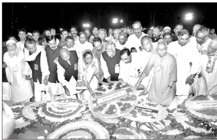
14-party opposition combine