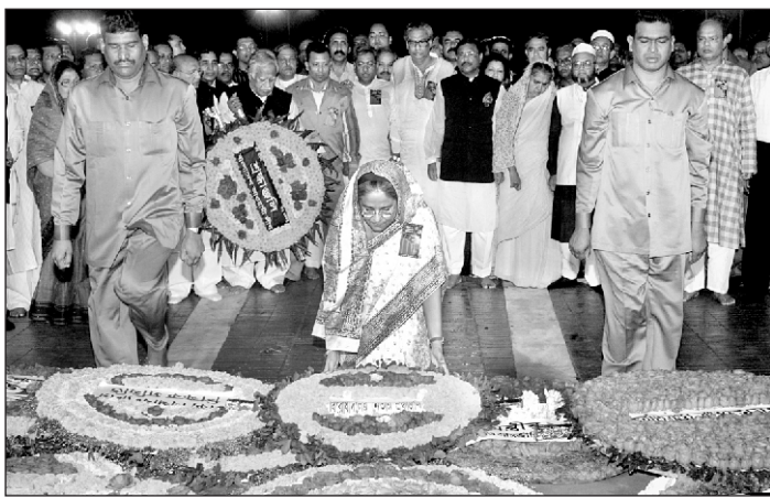
Leader of the Opposition in Parliament Sheikh Hasina