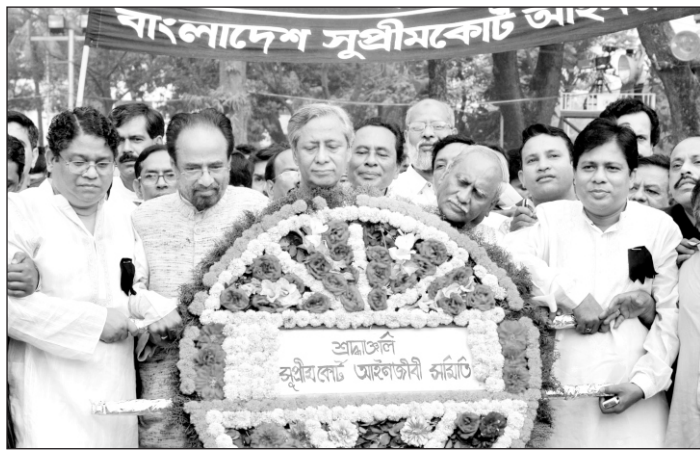
Supreme Court Bar Association