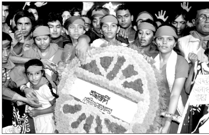
Kendriya Khelaghar Asar