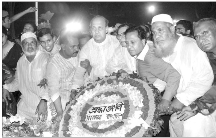
Bikalpa Dhara Bangladesh