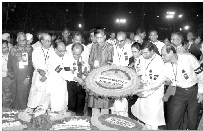
Dhaka University Teachers' Association