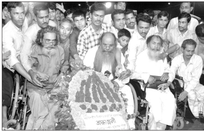
Wounded freedom fighters