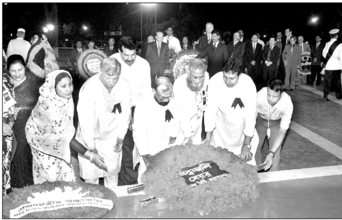
Mayor Sadeque Hossain Khoka