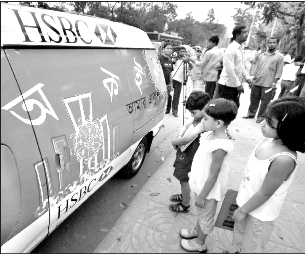
Children look at a microbus of HSBC bank decorated with the theme of 'Ekushey February' near the Bangla Academy in the city yesterday. The HSBC arranged a spot quiz contest for the visitors to the Ekushey Book Fair.