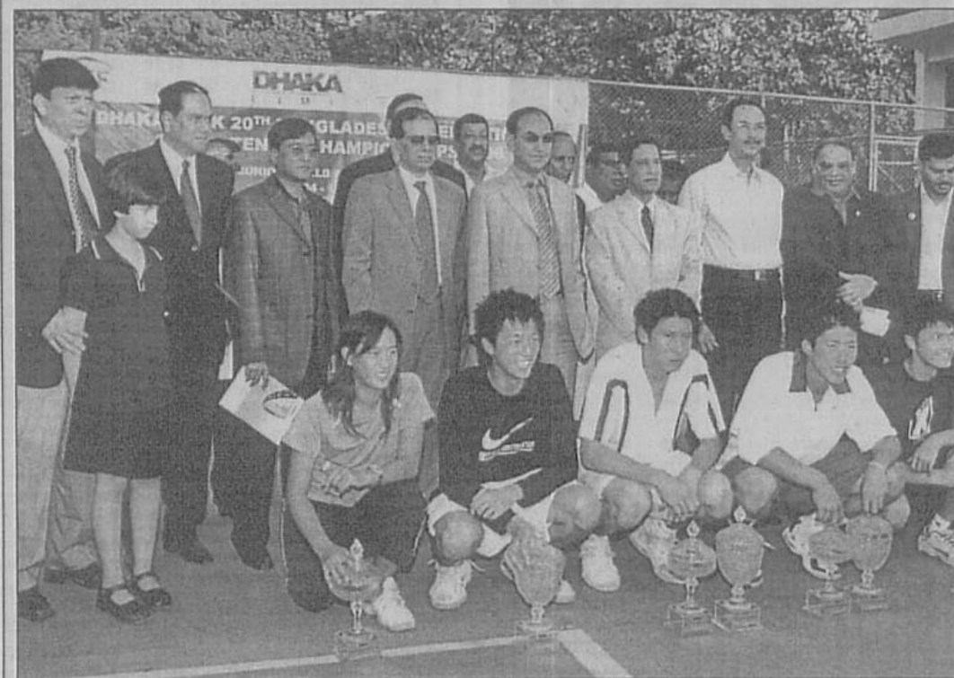
Winners of the Dhaka Bank 20th Bangladesh International Junior Tennis Tournament are seen with chief guest Housing and Public Works Minister Mirza Abbas (C) during the prize giving ceremony on Friday.

As the motorcade made its slow progress it left a slew of detritus in its wake with hundreds of plastic sandals, Turkish slippers and shoes as well as the corpse of one fan, who was dressed just in the national flag.