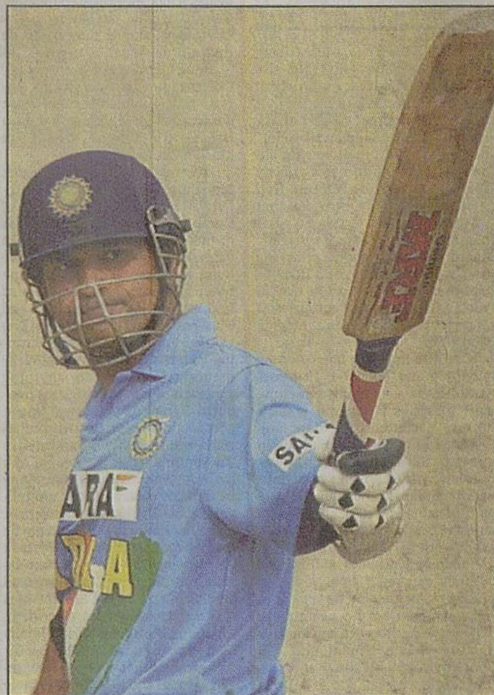
RECORDS ON ROLL: Indian maestro Sachin Tendulkar acknowledges the crowd's applause on reaching his 39th ODI century at Peshawar on Monday. During the course he also crossed the 14,000-run mark.

He also holds the record of most Test centuries with 35, having scored 10,386 in 129 Test matches.