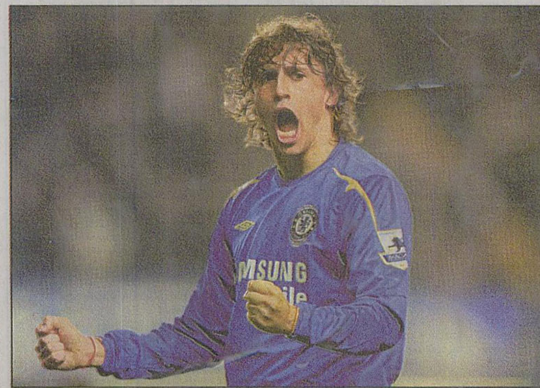
Chelsea marksman Hernan Crespo roars for joy after his strike against Liverpool in their Premiership clash at Stamford Bridge on Sunday.

One of Buchanan's fiercest critics has been former Australian Test captain and now television commentator Ian Chappell, who urged skipper Ricky Ponting to seek guidance from senior players rather than Buchanan.