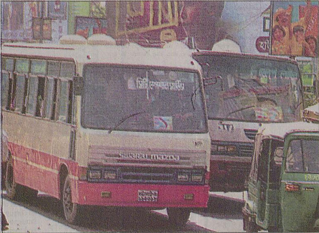
Wild and risky competition of city special service buses has become a common scene in the city streets.