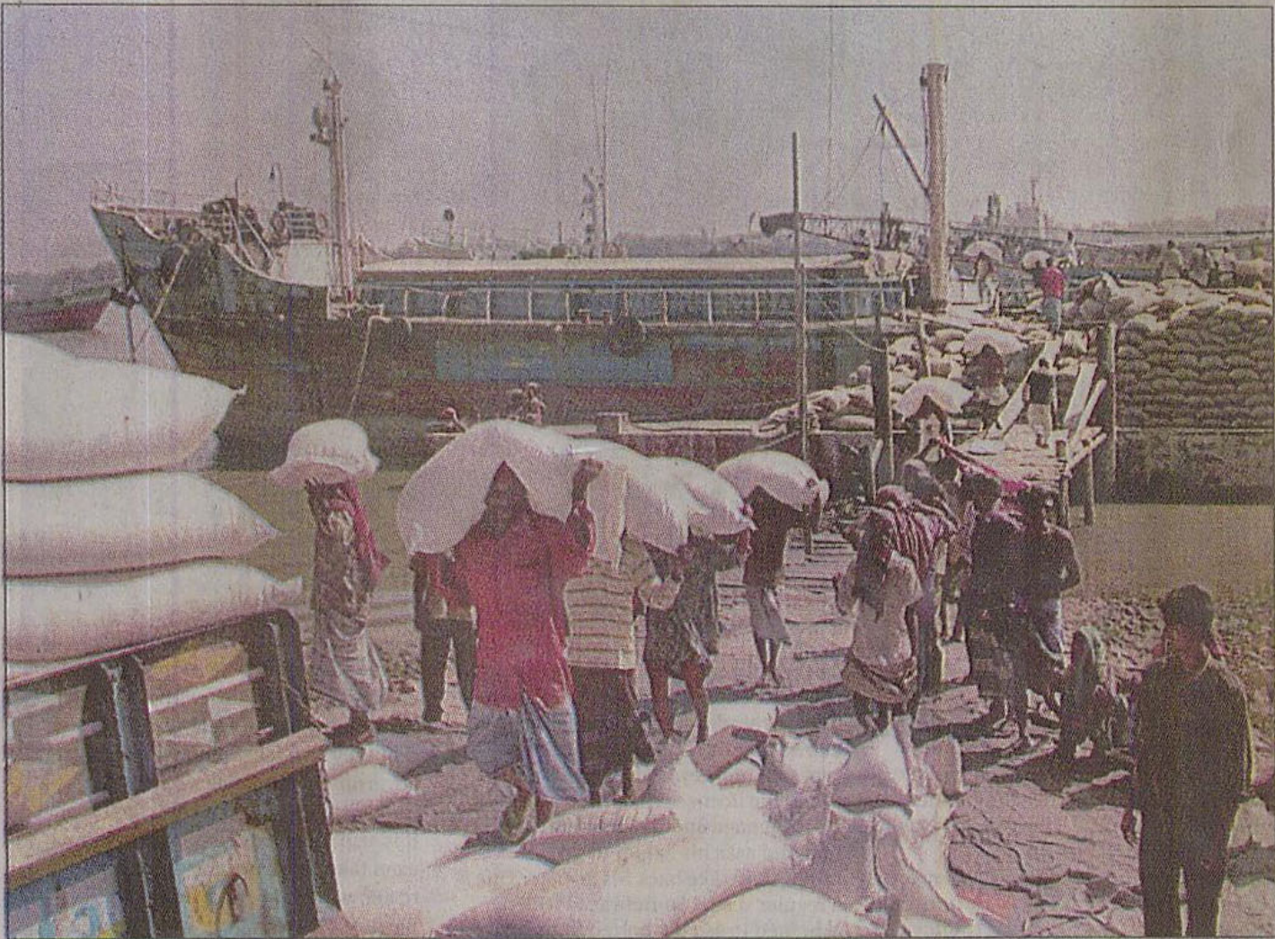
Workers offload cargoes from lighter vessels at the lighter Jetty at Sadarghat Bangla Bazar.