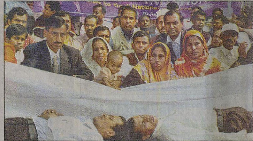
Teachers of community primary schools began a fast unto death at Mukhtang in the city yesterday demanding nationalisation of their jobs.

The Amar Ekushey Book Fair is held marking the Language Martyrs Day on February 21, which is now also observed as the International Mother Language Day.