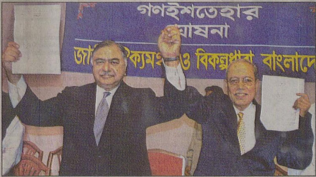
Jatiya Oikya Mancha President Dr. Kamal Hossain and Bikalpa Dhara Bangladesh President Badruddoza Chowdhury hold up the copies of 'mass manifesto' after they jointly announced it at Mahanagar Natya Mancha in the city yesterday.