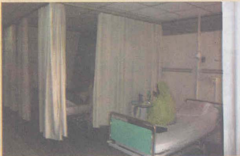
The general Wards at ICHRI are all partitioned to give the patients ample privacy for recovery.

The rooms of ICHRI can be broken down to Operation Theatres (OT), Cardiac Surgical Intensive Care Unit (CSICU), Surgical Stepdown and Ward. ICHRI has two modern fully equipped spacious operation theatres that has the ability to