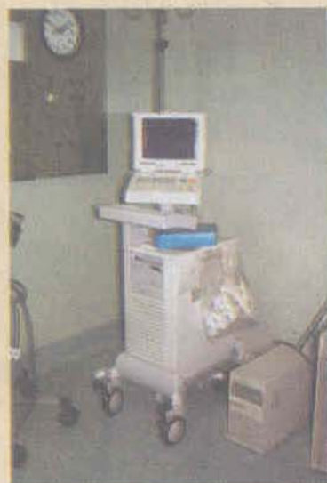
The Intra Aortic Balloon Pump is a special equipment that can give support to the heart for about 16 hours.

The centre's location is a major plus point. Being right beside BIRDEM, it can get all the assistance they need from the general hospital.