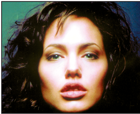
Gia On HBO at 09:30pm Genre: Drama Cast: Angelina Jolie, Faye Dunaway

All programmes are in local time. The Daily Star will not be responsible for any change in the programme.