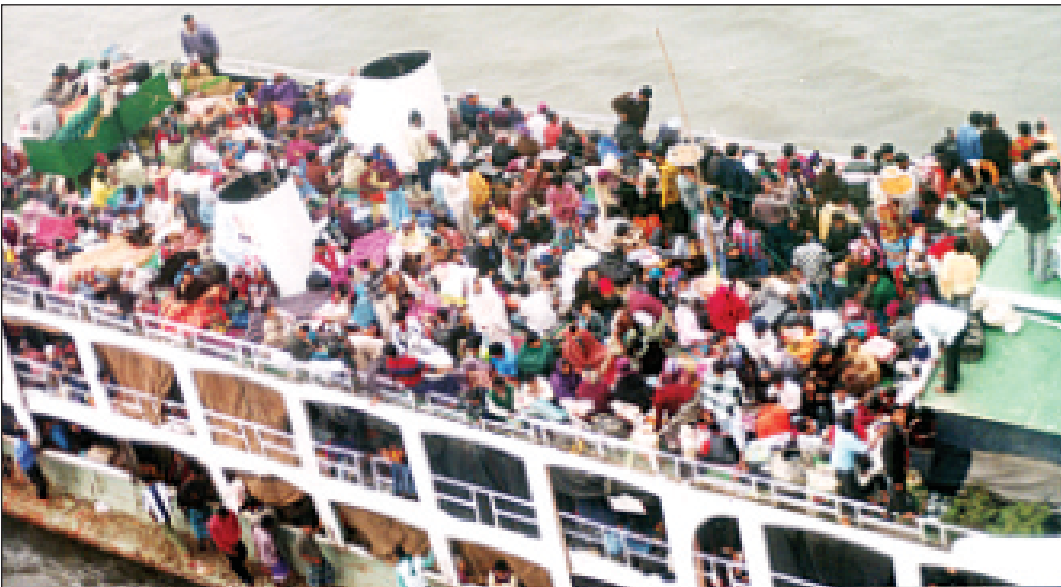
Coco-4 sets sail from Sadarghat launch terminal in the capital yesterday with its roof crammed with passengers, defying the BIWTA rules.