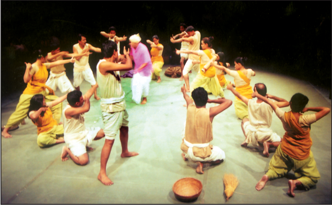
Actors of Aranyak Natya Dal in a dramatic scene from Raarang

Other plays staged on January 4 were Hamlet , Sarhat Paar Manto and a multilingual production, Stations .