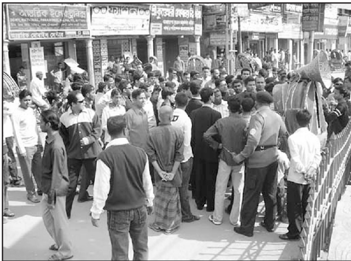
JCD holding a rally in Barisal city violating Section 144 (left) while police intercepting a BCL procession.

At least 6 lakh people of the upazila are hostage to the gang, they claimed.