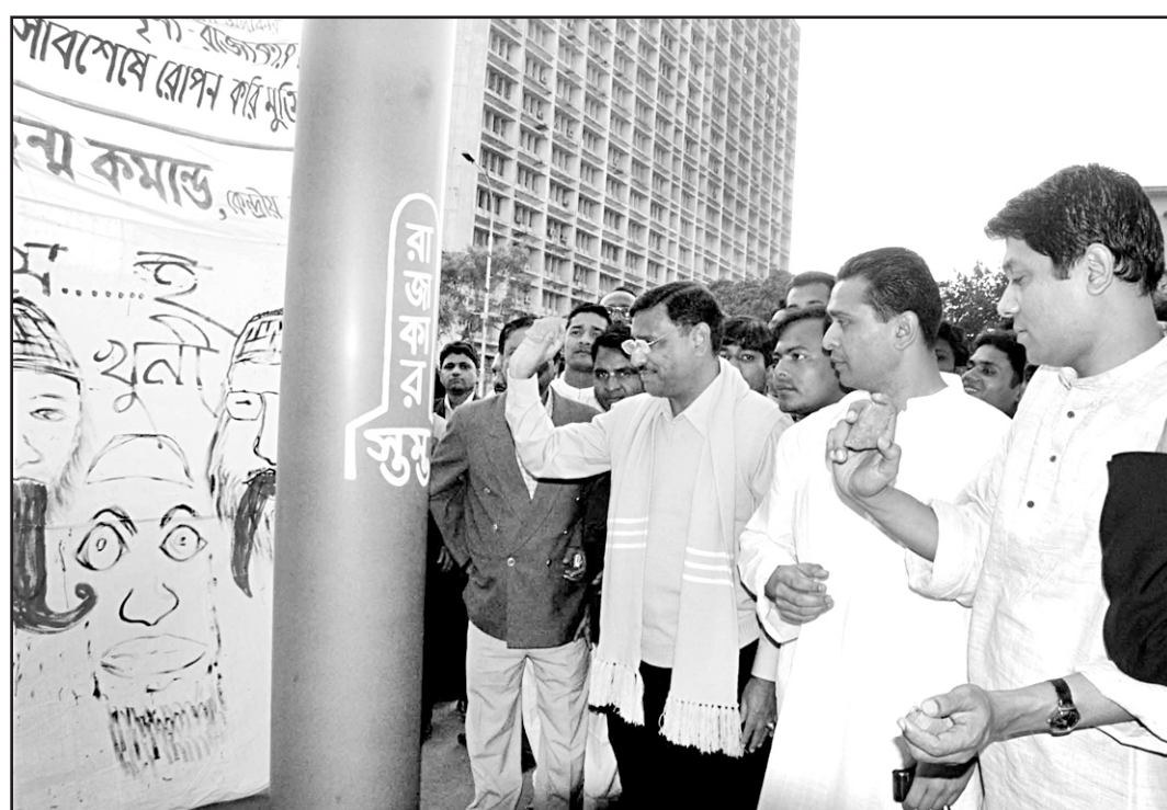
Awami League leader Obaidul Kader inaugurates the 'Razakar Pillar', at Muktangan in the city yesterday to express hatred against the collaborators of occupation Pakistani forces.