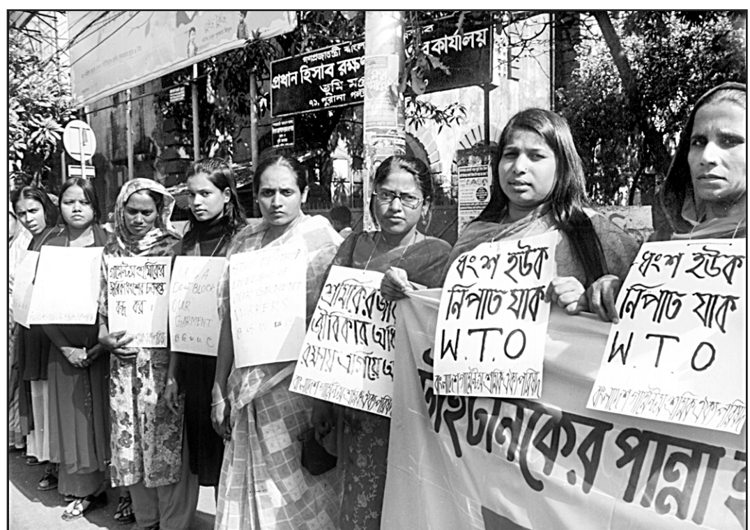
Bangladesh Garments Sramik Oikya Parishad stages a demonstration at Muktangan in the city yesterday protesting government's failure to protect workers' rights at WTO ministerial in Hong Kong.