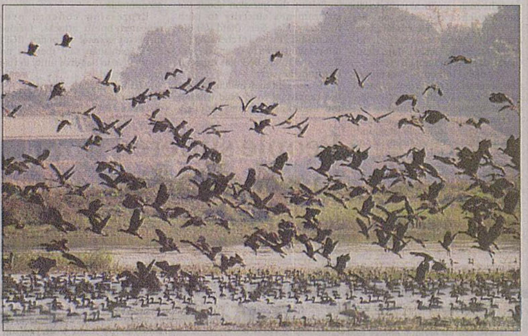
The Ceramic Lake in Mirpur in the city turns alive with thousands of migratory birds flocking together over the water body.

SHAKHAWAT LITON An alarming escalation of Islamist militancy and suicide bomb blasts was the biggest threat to public security as it overpowered all other kinds of criminal activities, political violence and killings in the year 2005 that ended yesterday. But negative politics has buried people's expectation of rooting out the militants who have established a reign of terror by carrying out countrywide serial blasts and attacks on courts and other establishments, killing judges, lawyers and commoners. The government's role in tackling the militancy has been questioned as it turns a deaf ear to the allegations against Jamaat-e-Islami, some ministers and ruling party lawmakers of patronising and protecting the militants. The new year starts with the opposition seeming to focus their agitation on the resignation of the four-party government accusing it of harbouring militants and failing to govern the country efficiently in the last four years. In the last year of the coalition government, the politics is heading towards further confrontation as both the government and opposition are preparing to face each other in the street with an eye to the upcoming parliamentary election. The year 2005 that began with the assassination of former finance minister Shah AMS Kibria in a grenade attack witnessed new dimensions in violence and terrorism, human rights violation and ended with a presidential ordinance on wiretapping. Skyrocketing prices of essentials,