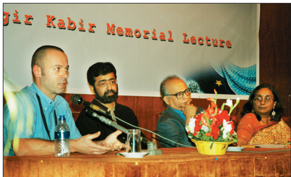
Discussants at the seminar