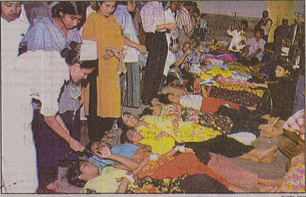
Workers of Continental Apparels of Manipuripara in the city injured in a stampede sparked off by a rumour of fire being treated at Dhaka Medical College and Hospital yesterday.

materials on the Dhaka-Aricha Highway on February 20. They showed the six men arrested under the Section 54 of the Criminal Procedure Code and produced them before a first class magistrate's court in Dhaka on February 22 with a prayer for a seven-day remand to interrogate them. The court granted a two-day remand. Thirteen days into their arrest, SEE PAGE 15 COL 4