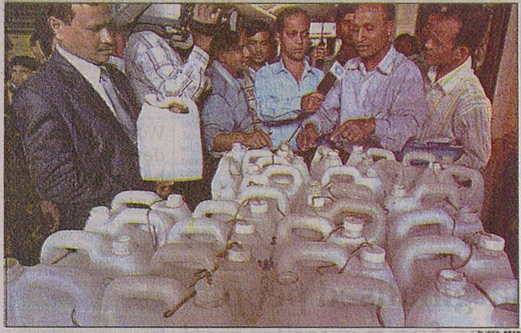
A mobile court seizes water containers without BSTI seals from a Nilkhet shop in the city yesterday. The court awarded the shop owner a hefty fine.