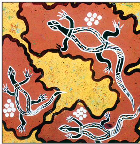
Authentic aboriginal art on display