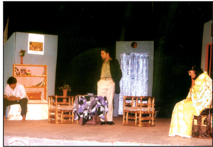
A scene from the play