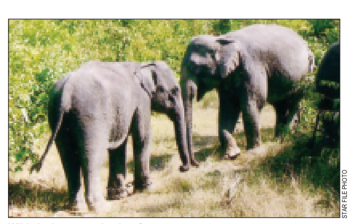
SEE PAGE 15 COL 4 Wild elephants grazing in a forest.

About 50 people were killed and a large number of them injured in confrontations with elephants in the last few years. As the humans invaded their habitat, groups of wild elephants destroyed hundreds of