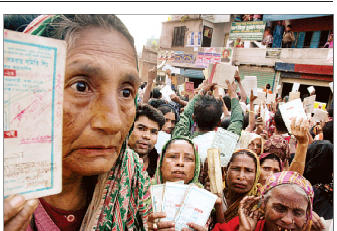
Agitating poor at Jatrabari in the capital show deposit books of a cooperative association, leaders of which disappeared yesterday after swindling a few crores of taka deposited by them.