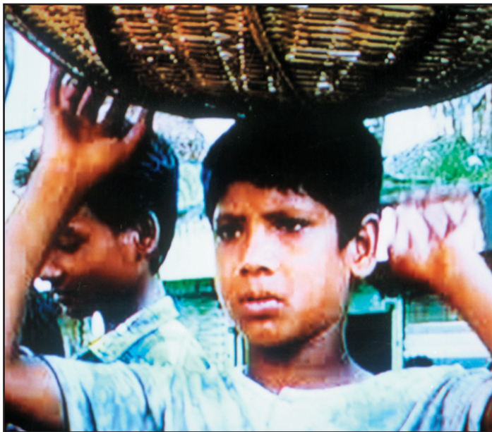
A scene from Kuli