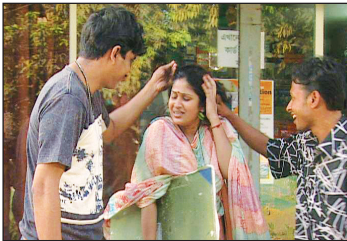
A dramatic scene from Ontoraler Kotha: Neetu