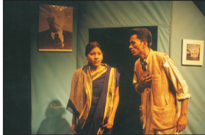
Actors in a scene from the play