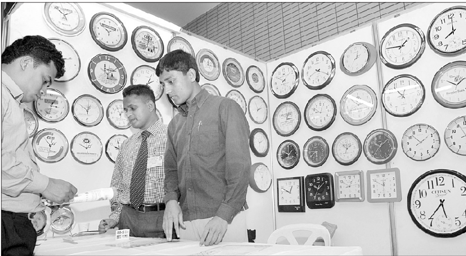
The four day long plastic goods fair that attracted a large number visitors ends today at Bangladesh China Friendship Conference Centre.