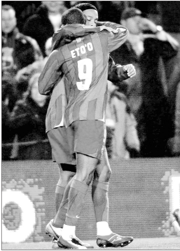
Samuel Eto'o of Barcelona is being congratulated by teammate Ronaldinho after he scored a goal against Celta Vigo during their Primera Liga clash at the Nou Camp on Tuesday.

The Celta keeper saved from Giuly again in the final minute.