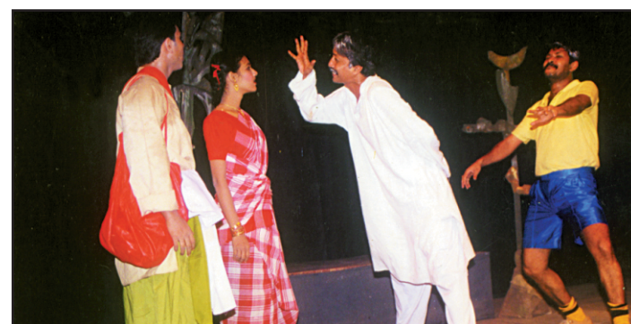
A scene from the play Two Idiots