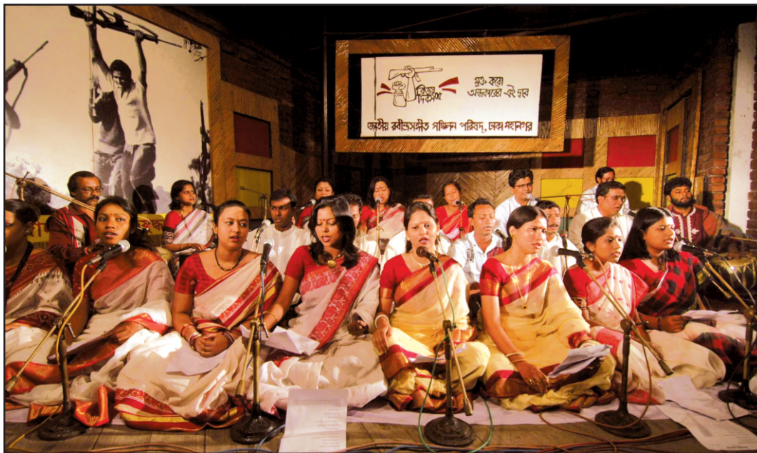
Artistes performing a chorus song at the programme

A patriotic Nazrul song, Durgam giri kantar moru was rendered by the group, which spoke about the need to boost the morale of the masses, urging them to unite against all social