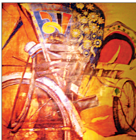
Md Zohurul Islam : Tradition