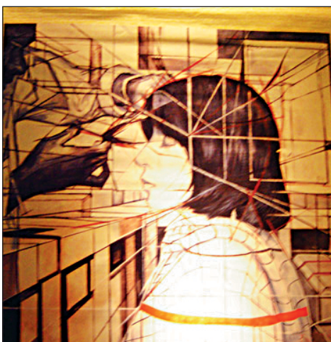
Sahid Kazi: Social perspective