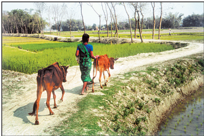
Zia Islam captured this picture of a woman guiding two calves home