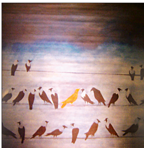
Hanifur Rahman: Conversation