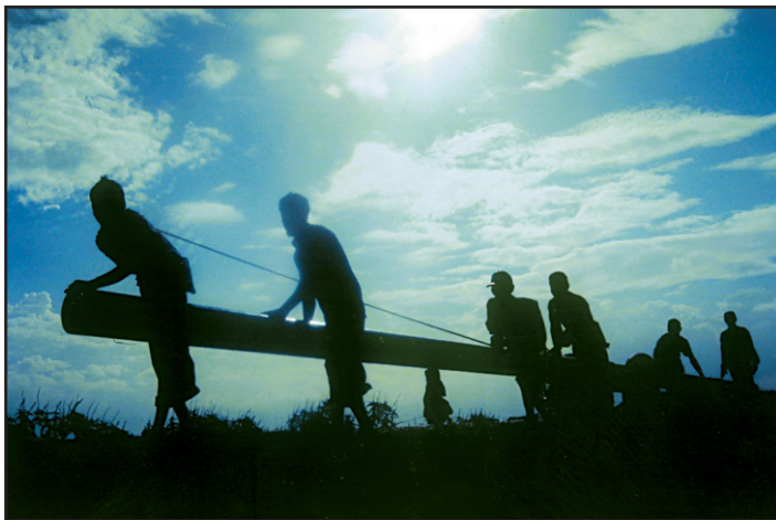
Sharif Sarwar's photograph shows workers at the end of the day