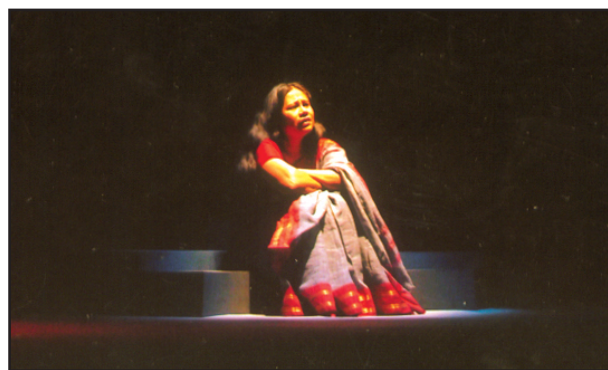
A scene from the play Mrinaler Chithi