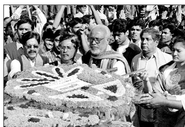
Different political parties and organisations place wreaths at the National Memorial in Savar to pay homage to the liberation war martyrs yesterday on the occasion of the Victory Day. Clockwise from top left: Awami League, Gono Forum, Dhaka University, Jatiya Samajtantrik Dal, Bangladesh Mahila Parishad, Krishak Sramik Janata League, Jatiya Garments Sramik Federation, Amra Muktiyoddhar Santan, Karmajibi Nari and Bikalpa Dhara Bangladesh.