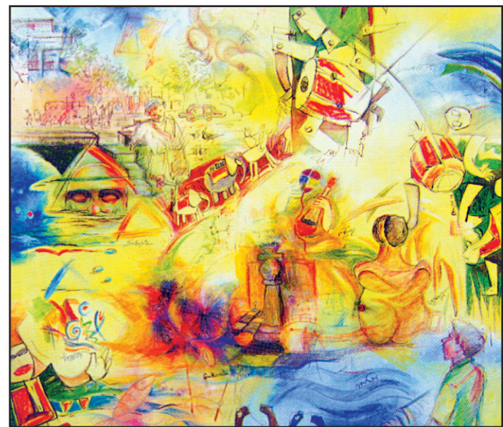
A dramatic image

The viewers left the gallery impressed by the treasure trove from the Chittagong University of Fine Arts.