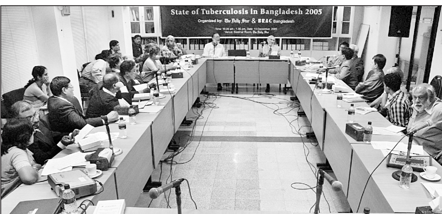
Participants at a roundtable on 'State of Tuberculosis in Bangladesh 2005' held at the seminar room of The Daily Star in the city yesterday. The Daily Star and BRAC jointly organised the event. (Story on Page 16)