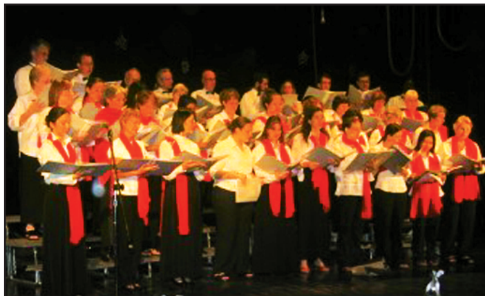
The combined choir of Cantemus and Morning Sky perform Christmas songs

Though not in the spotlight after the concert, the members of the two groups can continue to pursue their passion for music at their weekly get togethers.