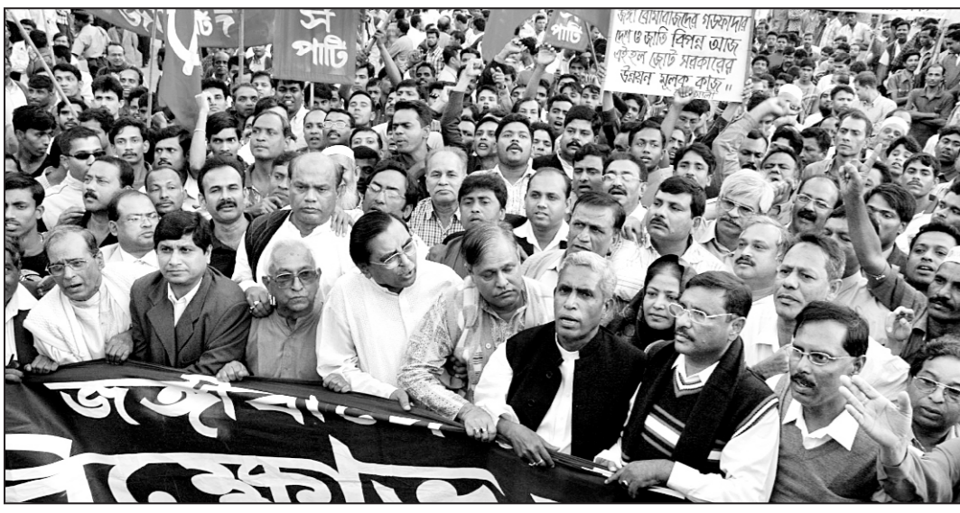
Opposition 14-party stages a demonstration at Muktangan in the city yesterday demanding resignation of the alliance government.

When asked about the term 'Bangladeshi Bihari', he said those who came here before 1971 and who were born here after 1971 are actually Bangladeshi Bihari. He urged the government to consider the human rights issue of this destitute Biharis. He also alleged that crores of taka is being misappropriated in the name of helping the Biharis by a vested quarter.