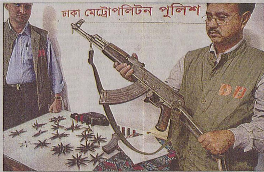
A member of Detective Branch of police shows an AK47 assault rifle and its ammunition recovered from Dania in the capital on Friday night.