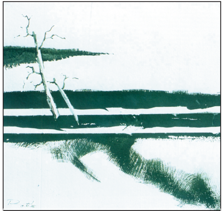
Sound of solitude - 5

left untouched to lend space. The people included were seen in scintillating but delicate Impressionistic hues. The hut, the subject was also lyric and carefully composed within the composition. The one on the mangrove forest was nearly as thought-provoking as some of the parallel entries by much more senior artists seen earlier, at Chittrak.