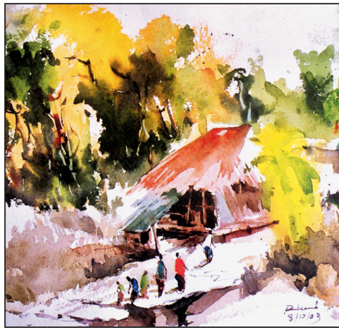
Countryside - 3

Dwelling on his favourite landscape pieces, Russell said that his experience in Bandarban had been most fruitful. He said that the spots brought in most elements of landscape, such as hills, beautiful clear sky, flowing rivers and the locals being included in that scenario. "The elements are changeable, along with the fluctuating background scene. Today I'm doing black-and-white landscapes, such as the one of mangrove forests," says