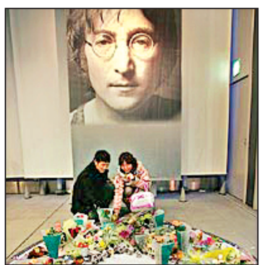
Fans paying tribute to Lennon

Lennon's message still seems to remain ablast among his fans: "Peace and love and live the best you can."