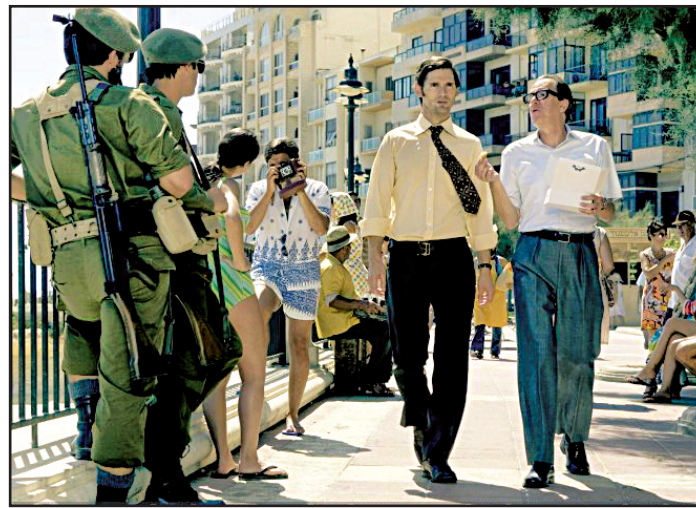
(Top) Eric Bana (C) with co-actor in Munich, (Bottom) Ziyi Zhang with Ken Watanabe in Memoirs of a Geisha