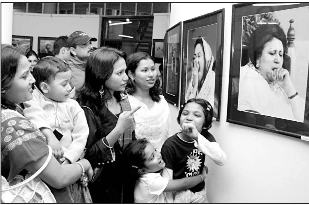
Visitors look at photos at an exhibition of six photojournalists at the gallery of Fine Arts of Dhaka University that began yesterday.