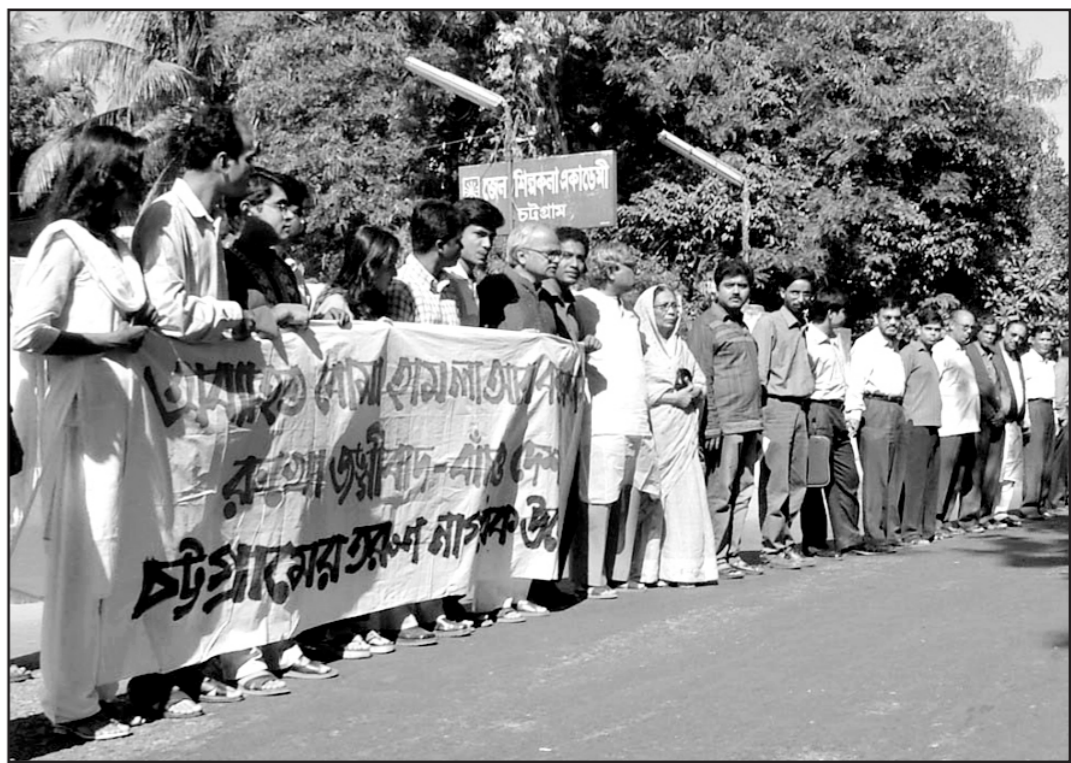
Youth citizens of Chittagong forms a human chain at Shilpakala Sarak in Chittagong city yesterday protesting continuous bomb attacks across the country.