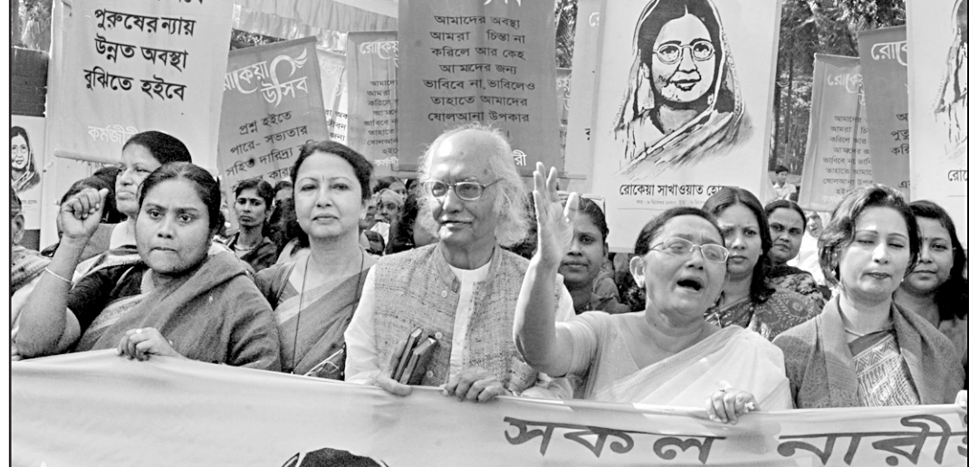
Karmajibi Nari, a women's rights organisation, takes out a procession in the city yesterday on the occasion of the Begum Rokeya Day.