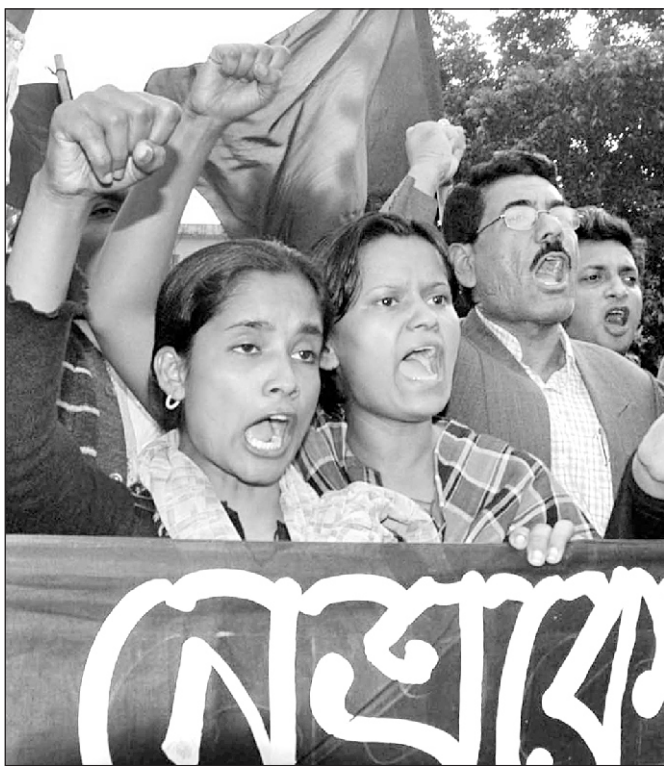
Clockwise from top left: City Awami League, Communist Party of Bangladesh, Udichi and Bangladesher Samajtantrik Dal stage demonstrations in the city yesterday protesting bomb attacks in Netrakona.