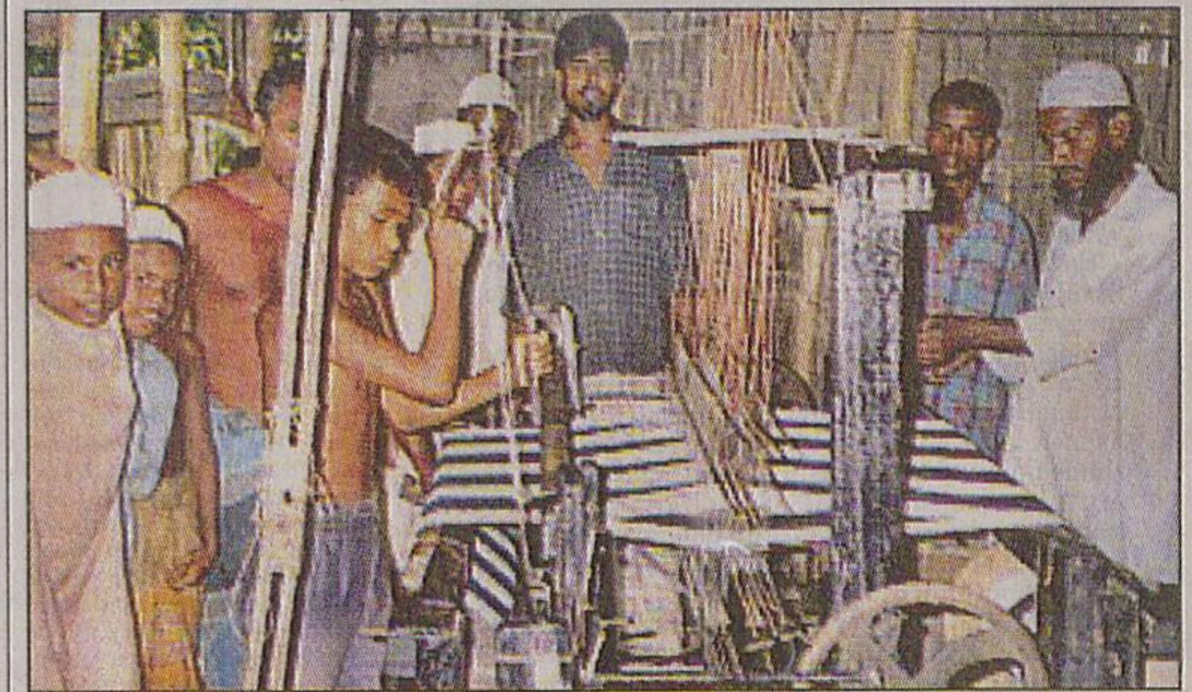
A landless family working on a weaving machine in Bhangamore in Saghata upazila in Gaibandha district.

When contacted, the DC said the program has been dropped on security reasons.