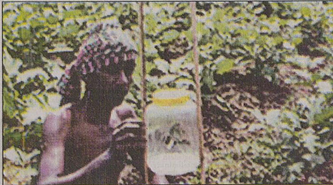
A farmer using a pheromone trap in a brinjal field in Gaidghat village in Jessore.

But the assurance has not turned into a reality, plunging the farmers into uncertainty.