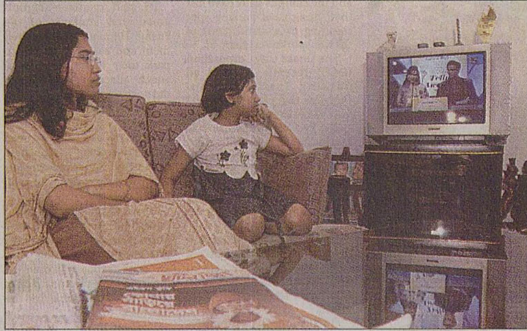
Viewers nowadays watch whatever the cable operators offer.