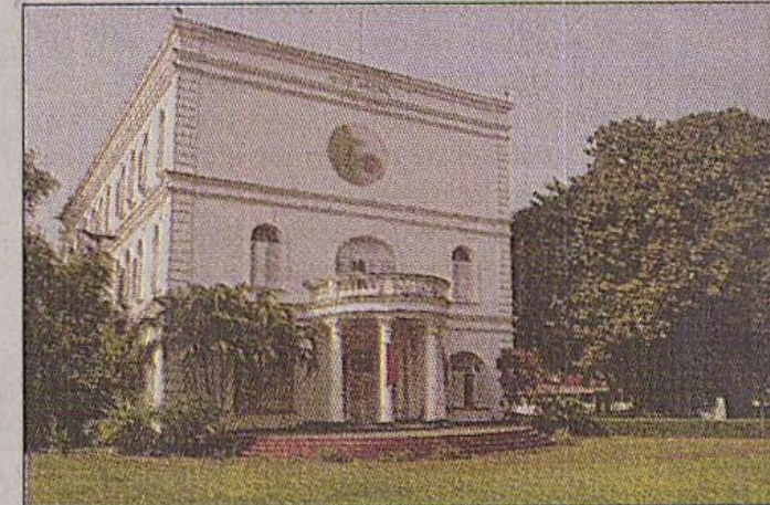
The Bangla Academy.

But according to a very senior official a crisis prevails with the Bangla Academy dictionary, which is not timely updated along with updated versions of Rokeya and Nazrul Rahanabali