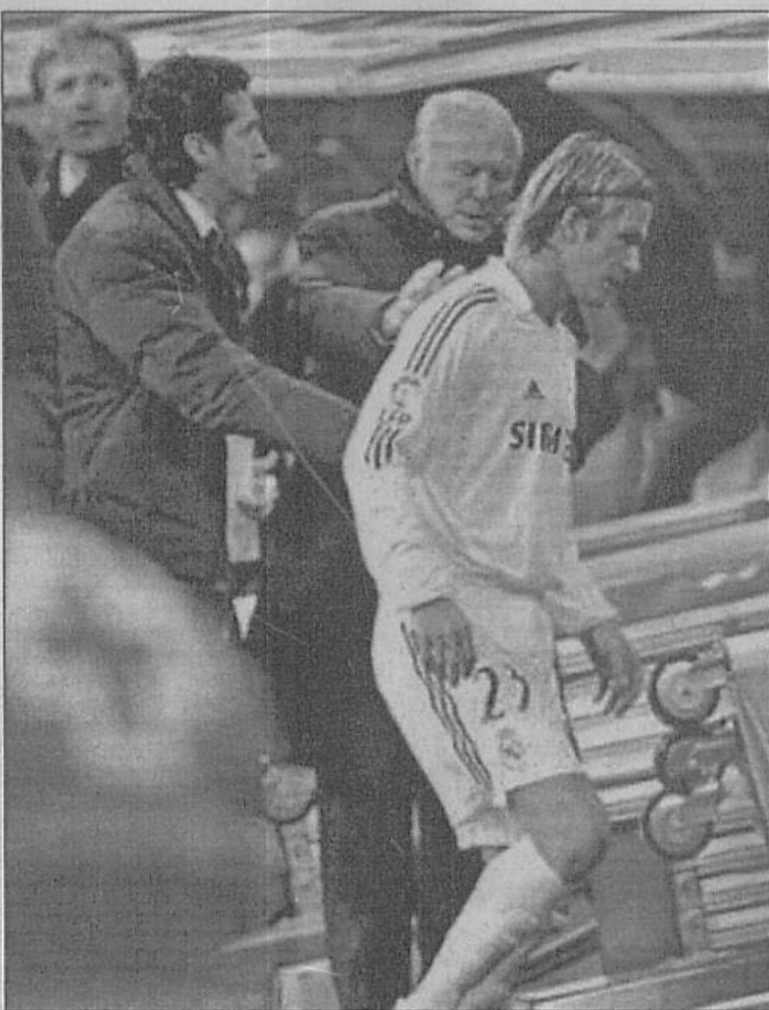
UNLUCKY SEVEN! David Beckham of Real Madrid leaves the ground after being red carded during their Primera Liga tie against Getafe at the Bernabeu in Madrid on Saturday.

In spite of the win, the Bernabeu crowd showed their frustration by whistling the Real players off the pitch at the end of the match.