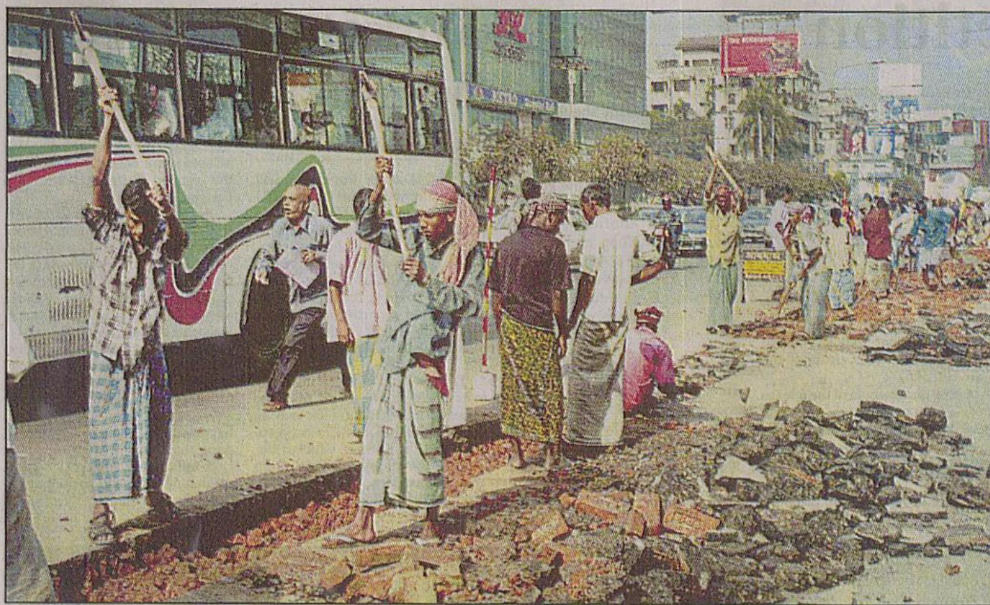
Workers dig a road at Sukrabad in the city yesterday for the laying of gas pipeline, causing suffering to passers-by as well as passengers.