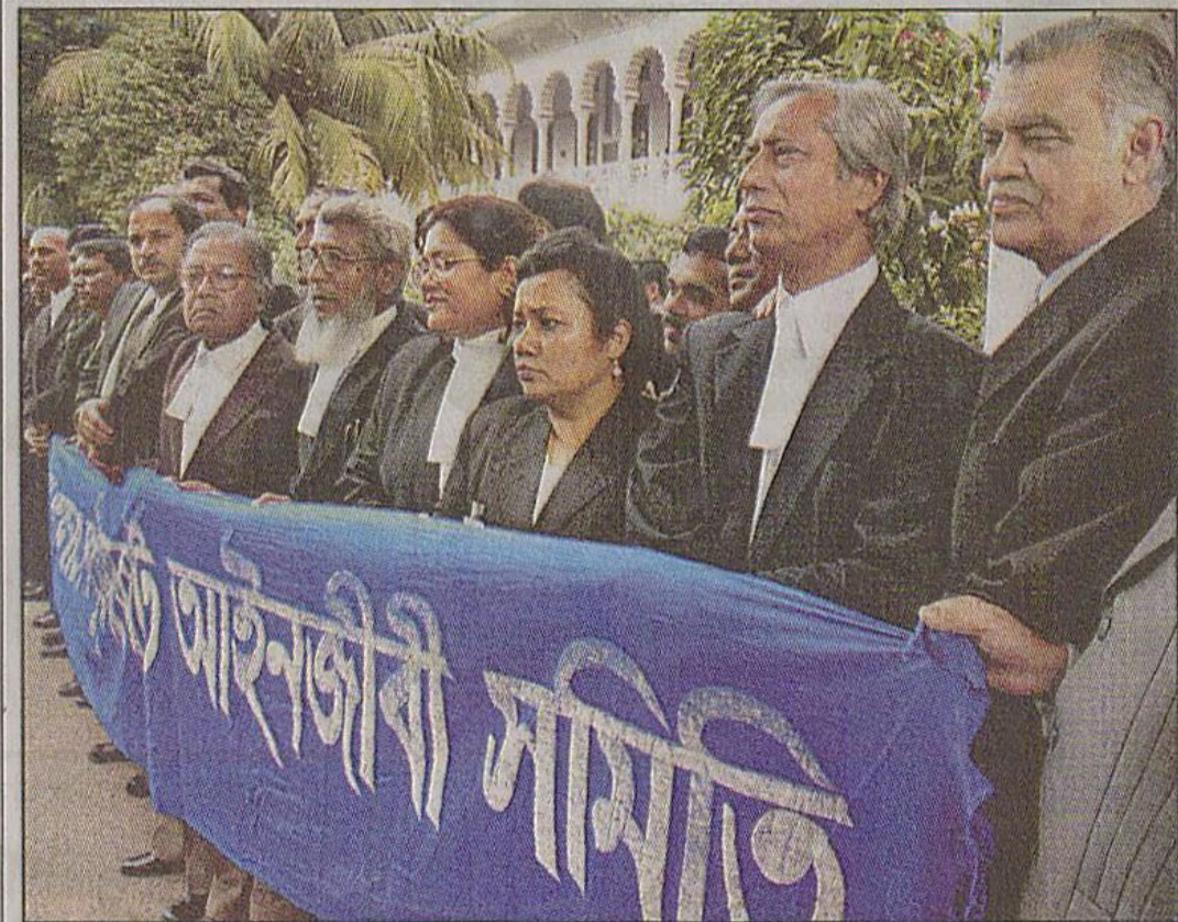
Supreme Court Bar Association forms a human chain in front of the High Court in the city yesterday protesting bomb attacks on courts and demanding resignation of the government.