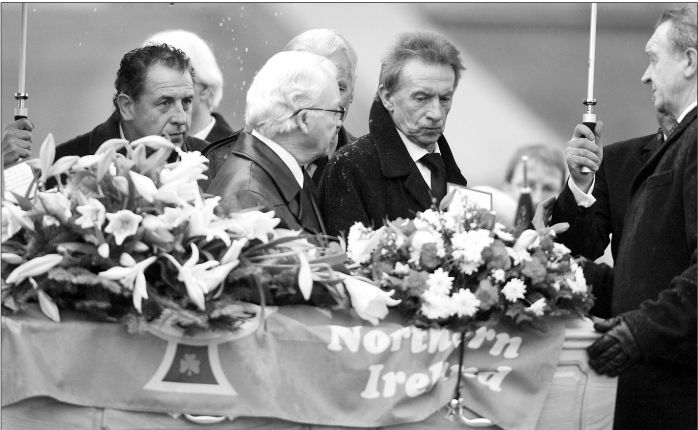
EVEN THE NATURE IN TEARS: Ex-Scotland footballer and friend of George Best Dennis Law (2nd R), former Northern Ireland manager Billy Bingham (C) and former Northern Ireland footballer Gerry Armstrong (L) stand next to the coffin of legend Best in front of the Stormont Parliament building before the funeral ceremony in Belfast on Saturday.