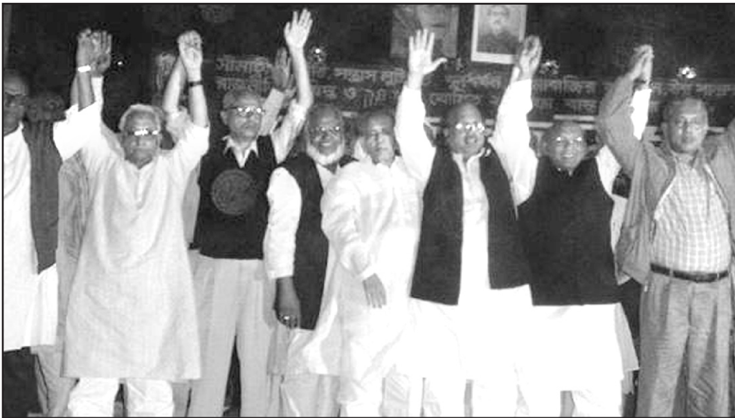
Leaders of 14-party opposition alliance wave at party men at a conference in Mugura yesterday.

14-party workers' meetings in Satkhira, Magura told