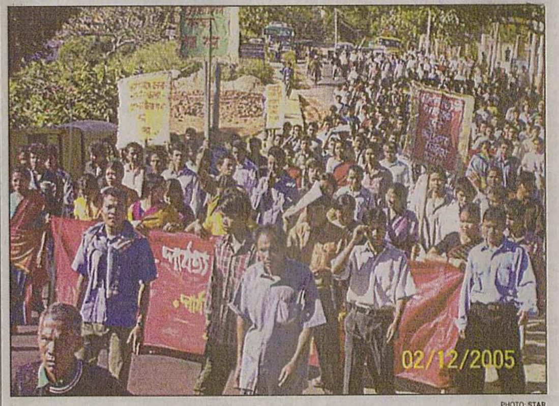
Parbatya Chattagram Jana Sanghati Samiti brings out a procession in Ranganati yesterday marking the eighth anniversary of signing of the CHT peace accord and demanding its full implementation. Story on page 6