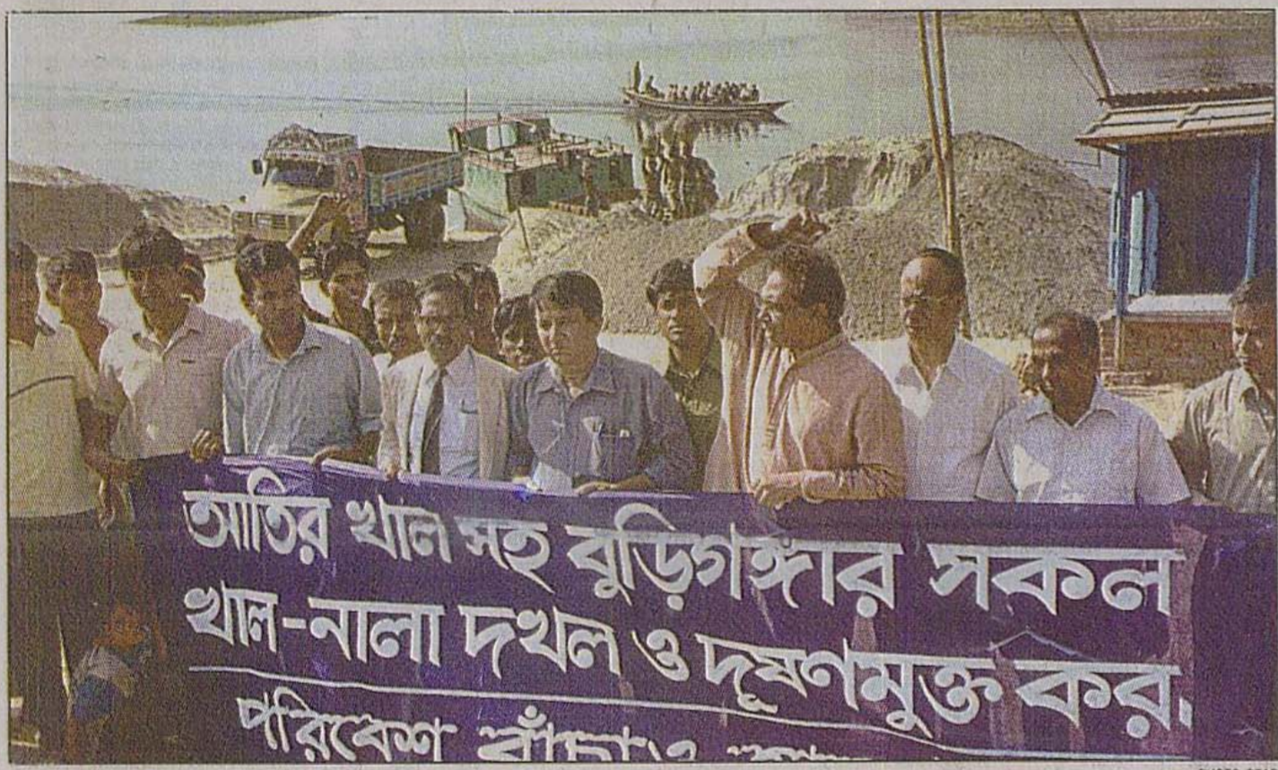
Save the Environment Movement forms a human chain yesterday on the south side of the Martyred Intellectuals' Memorial at Rayer Bazar in the capital demanding reduction of pollution in all the canals linked to the Buriganga River including Ati's Canal.