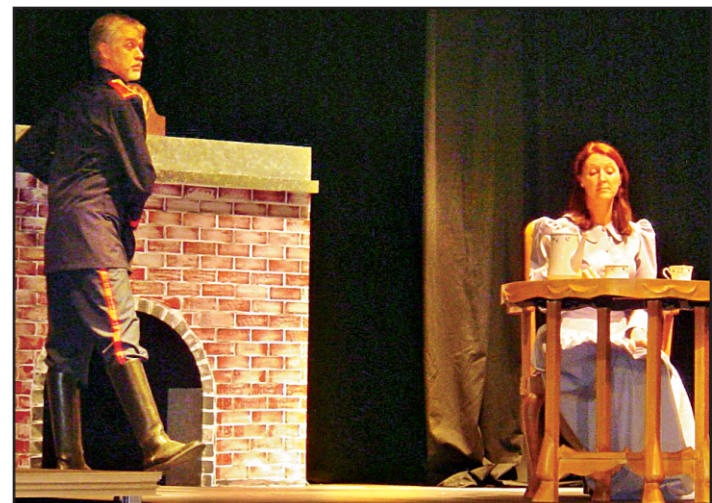
Actors performing in A Little Night Music