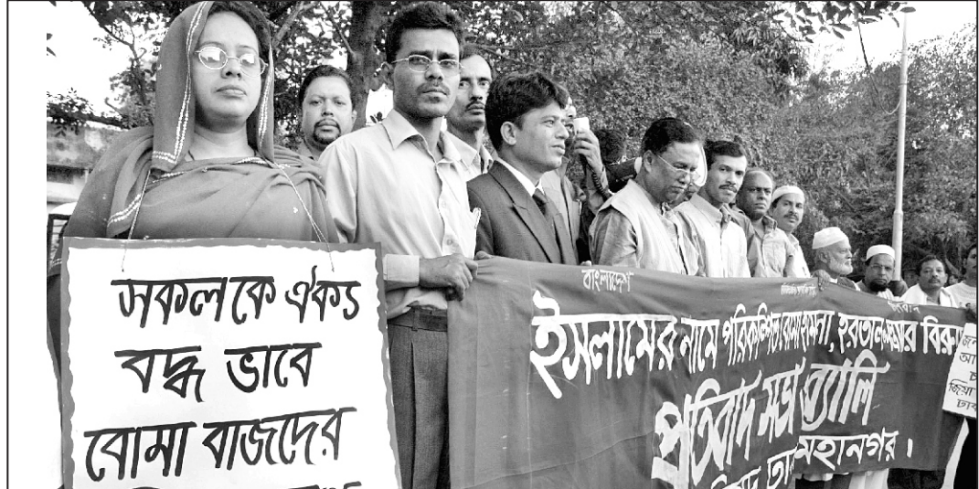
Different organisations took to the streets in the city yesterday to protest the spate of bomb attacks across the country. From top are Awami Sechchhasebak League, Metropolitan Bar Association, Bangladesh Jubo Maitry and Zia Parishad.