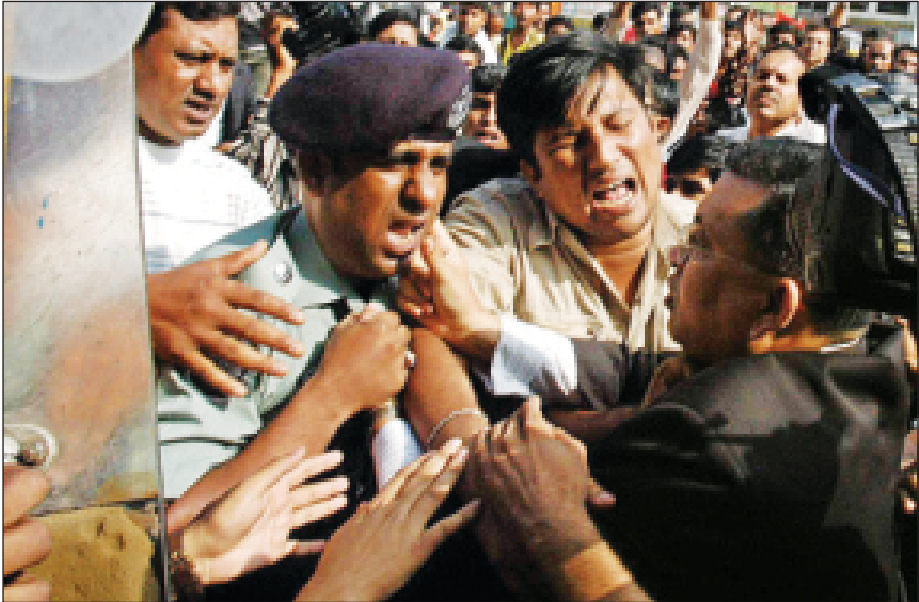
Left: A lawyer holds a high official of police by the collar at Paltan during hartal yesterday; right: police drag Jubo Mohila League activists at city's Russell Square during hartal.