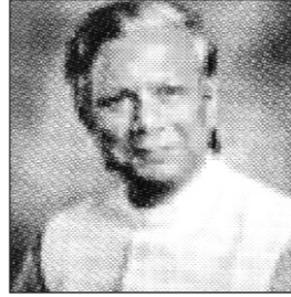
Prof Muhammad Yunus