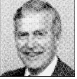
Timothy E Wirth