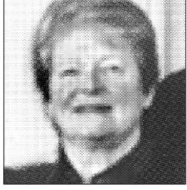
Gro Harlem Brundtland