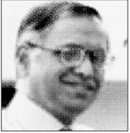
NR Narayana Murthy