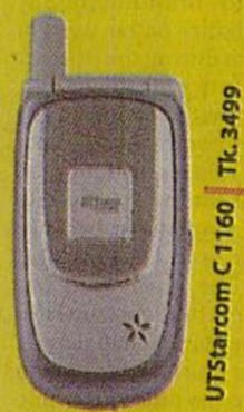
UTStarcom C1160 Tk. 3499