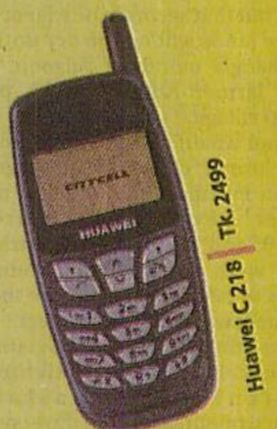
Huawei C218 Tk. 2499