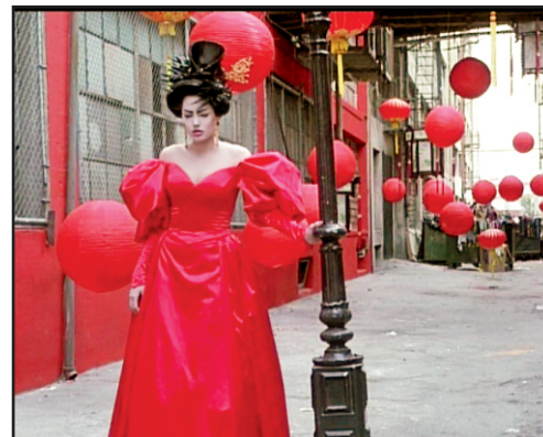
Gia On HBO at 01:45pm Genre: Drama Cast: Angelina Jolie, Faye Dunaway