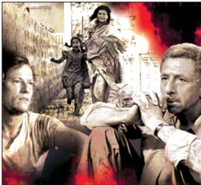
A scene from the film