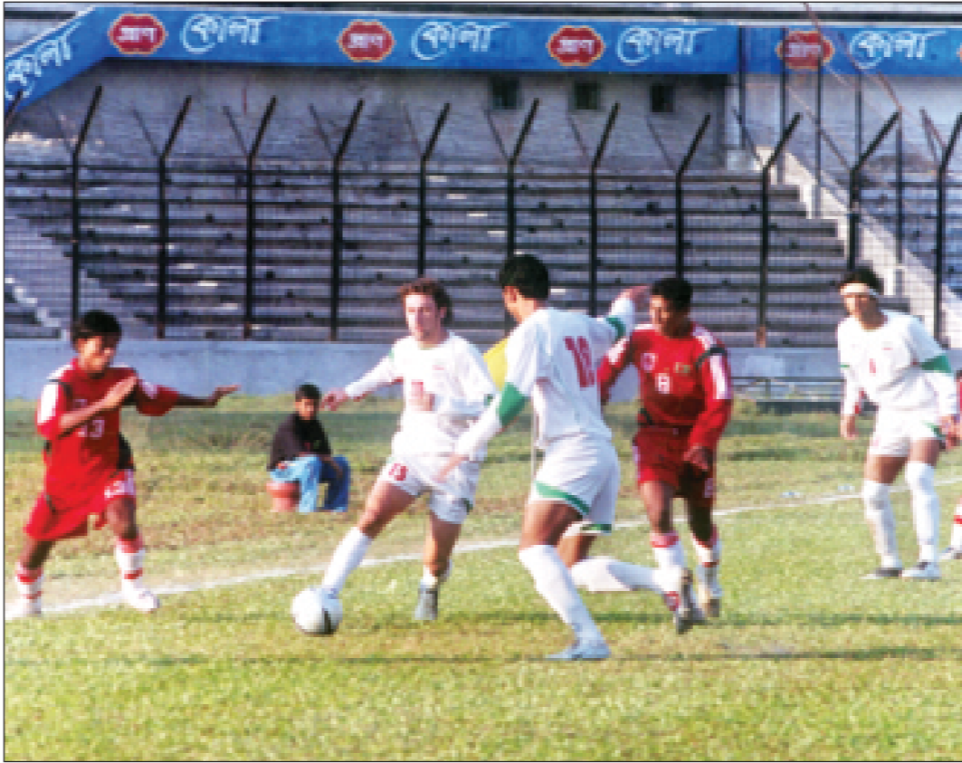
Action from yesterday's AFC Under-20 Championship return-leg match between Bangladesh and Iran at the Bangabandhu National Stadium.